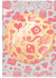
HEART 0.95 oz 23714