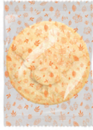
TURKEY 0.95 oz 23711