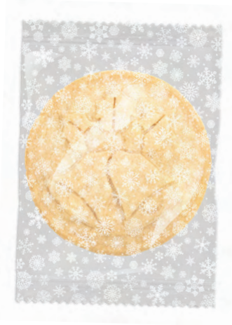
BELL 0.95 oz 23712

Add some festive fun throughout the year with our nut-free Holiday Sugar Cookies! Imprinted with seven exciting seasonal shapes, you can celebrate every occasion with these tasty, whole grain cookies, topped with the perfect sprinkling of sugar.