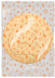
PUMPKIN 0.95 oz 23710

Darlington's 0.95 oz WG Holiday Sugar Cookies meet the USDA nutritional requirements to be a one (1) ounce grain equivalent by containing 16g of total creditable grain of which 8 grams are whole grain. The 51% whole grain source is: Whole Grain Flour.