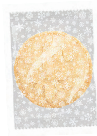
CANDY CANE 0.95 oz 23713