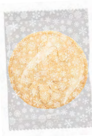
CANDY CANE 0.95 oz 23713

Add some festive fun throughout the year with our nut-free Holiday Sugar Cookies! Imprinted with seven exciting seasonal shapes, you can celebrate every occasion with these tasty, whole grain cookies, topped with the perfect sprinkling of sugar.