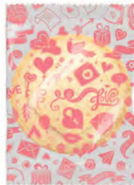
HEART 0.95 oz 23714