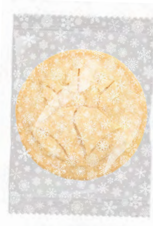
BELL 0.95 oz 23712