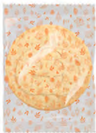
PUMPKIN 0.95 oz 23710

Darlington's 0.95 oz WG Holiday Sugar Cookies meet the USDA nutritional requirements to be a one (1) ounce grain equivalent by containing 16g of total creditable grain of which 8 grams are whole grain. The 51% whole grain source is: Whole Grain Flour.