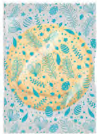
BUNNY 0.95 oz 23716