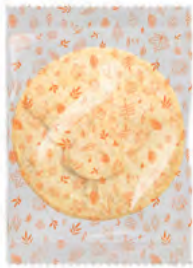
TURKEY 0.95 oz 23711